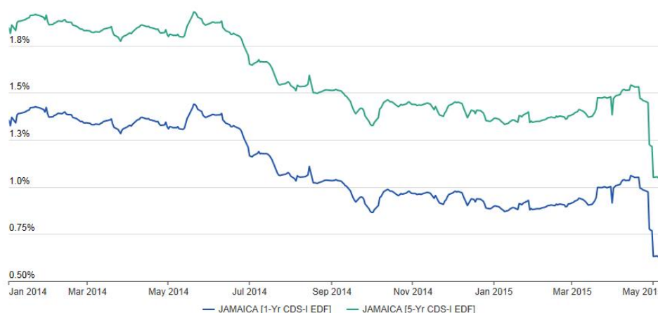
FIGURE 1. JAMAICA'S ONE-AND FIVE-YEAR SOVEREIGN EDF

Signals from government bond markets mirror this trend of declining sovereign risk. Yields on Jamaican government bonds have fallen across the curve, driven by lower risk of default and